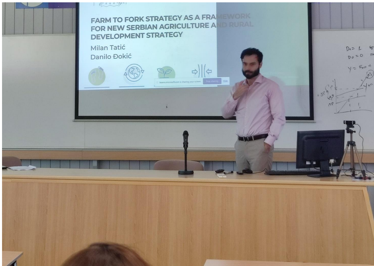
Picture 2. Presentation at panel discussion

After that, there was a discussion that resulted in the creation of a list of recommendations for the creators of Serbia's agrarian policy and conclusions that can be summarized as follows: