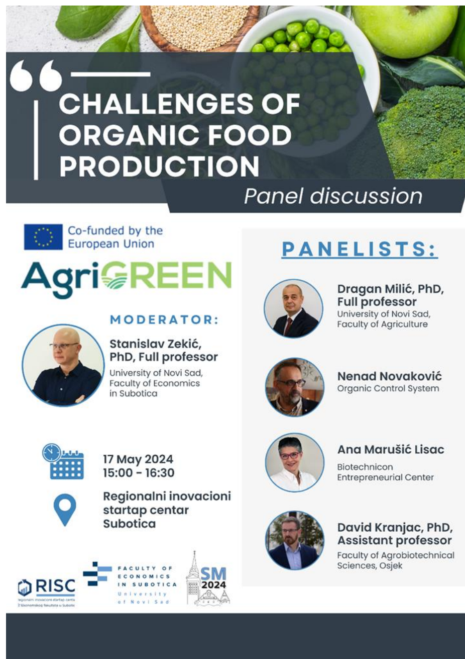
Picture 2. Agenda for panel discussion

The panel discussion was also attended by other members of the project team, representatives of UNS, as well as third-year students of the Faculty of Economics who were introduced to the issues of Agricultural Policy in the course Agricultural Policy and Sustainable Development. Total participants were 64 ( Annex A-Attendance list ).