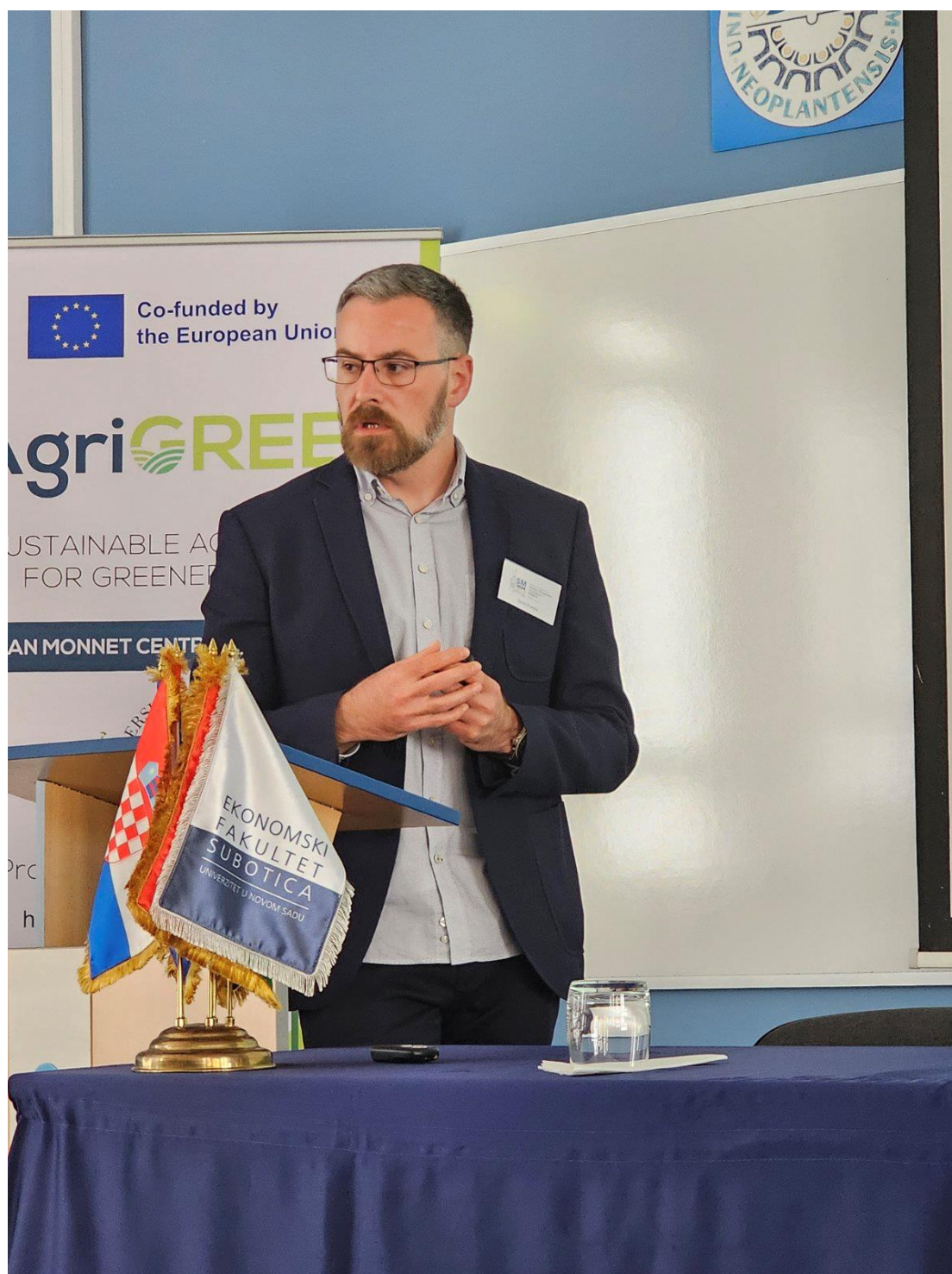
Picture 2. Presentation at panel discussion