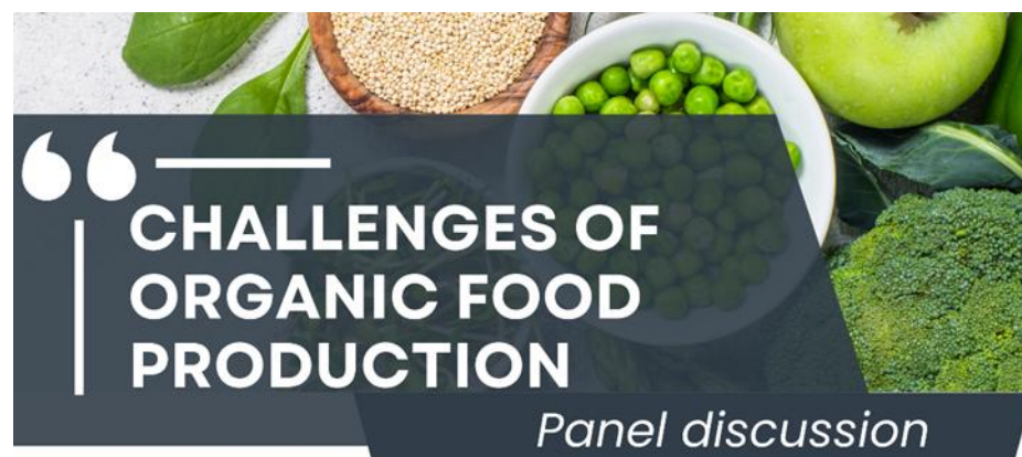
Picture 2. Agenda for panel discussion