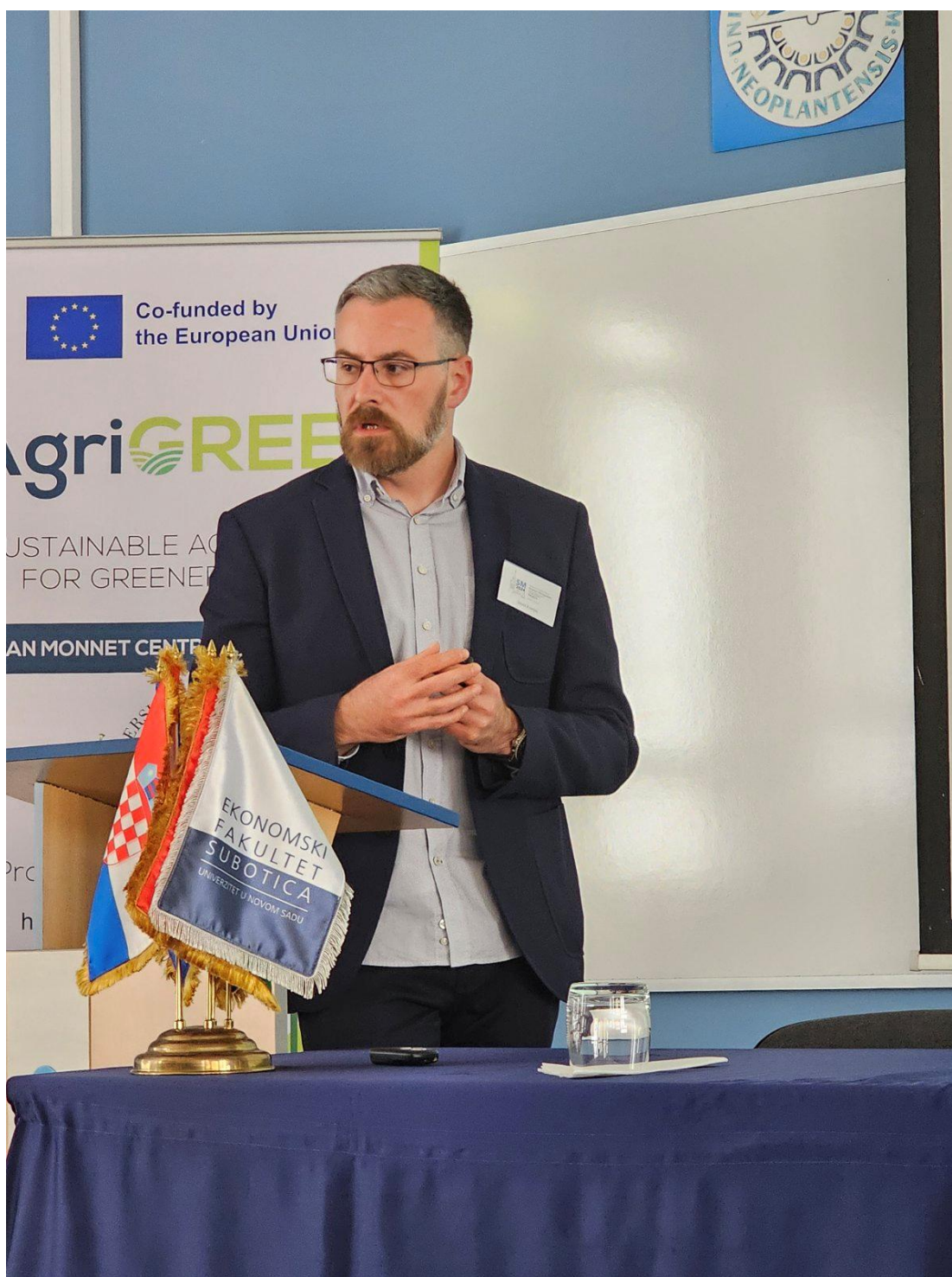
Picture 2. Presentation at panel discussion